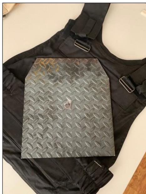
He is also preparing homemade body armor.