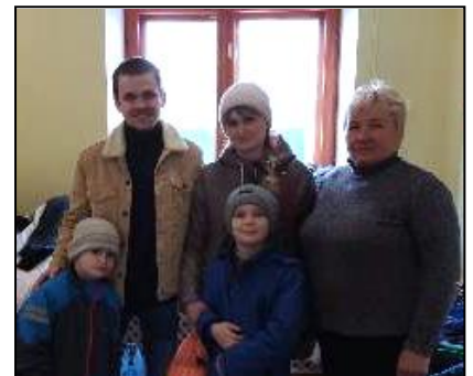
Clothing prepared for those in need, ( washed, folded, and ready! )