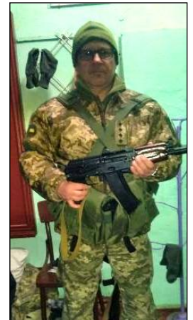
Men from our church are fighting in the war now.