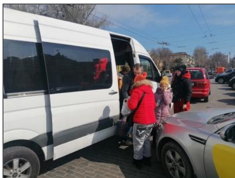
Brother Slava, a member of a church in Odessa, is helping people leave to safety.