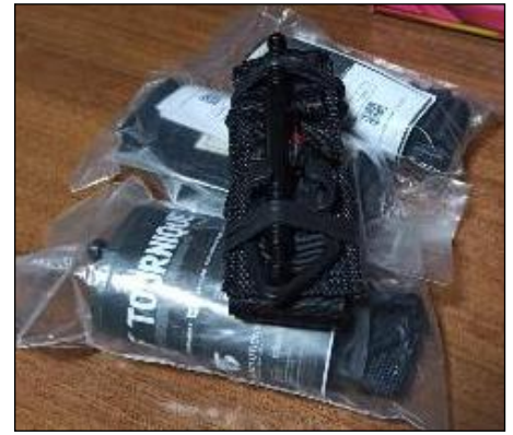
Body armor and emergency medical supplies for soldiers and civilians.